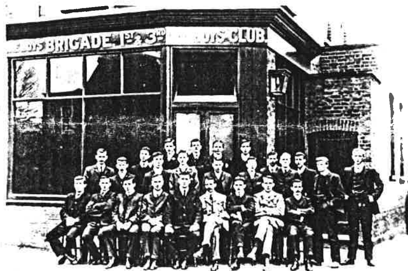
Members of the 1st and 3rd Enfield Old Boys' Club outside their headquarters in Lancaster Road, 1906.