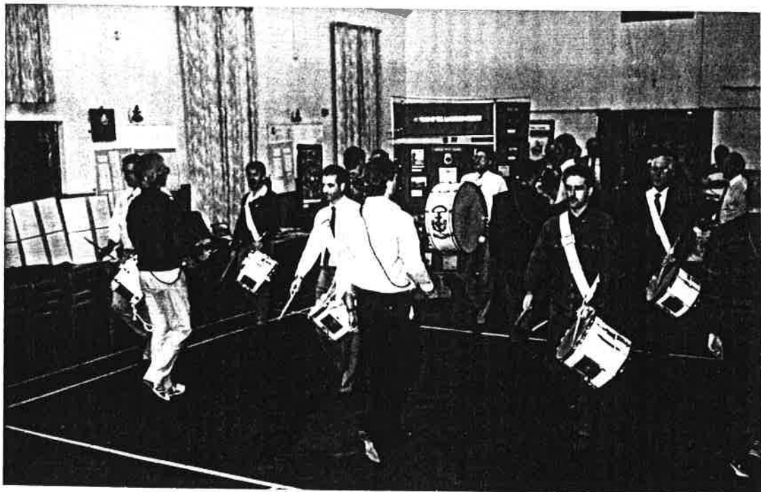
THE BAND AT THE OLD BOYS REUNION, "BRITISH BOYS" YET AGAIN.....