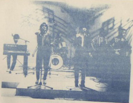
"HEARTBEAT" - the resident Band