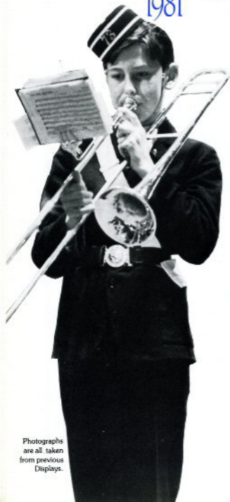
Photographs are all taken from previous Displays.