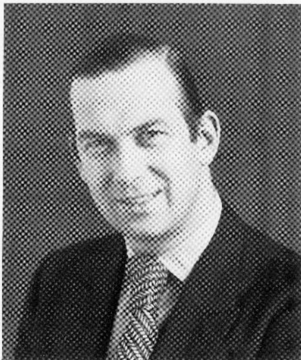
His Royal Highness Prince Michael of Kent