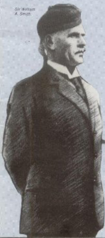
Sir William A. Smith.