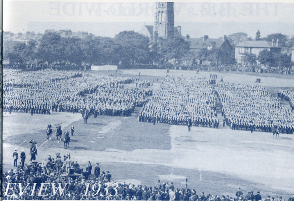
Glasgow, in the presence of His Royal Highness, Prince George.