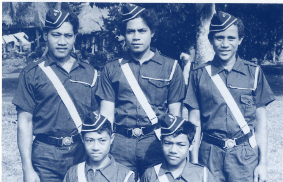
The B.B. in Western Samoa.

It started in Glasgow in 1883. Today it spans the world. Such was the genius of Sir William Smith that the Centenary of The Boys' Brigade is this year being celebrated in more than sixty countries by a family of some 420,000 members.