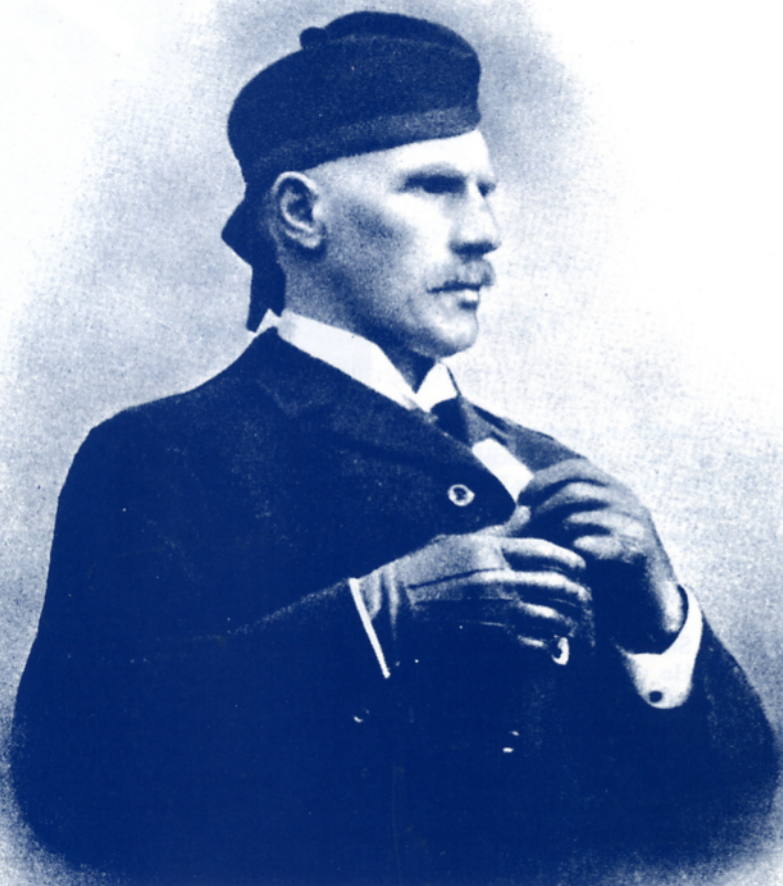
SIR WILLIAM ALEXANDER SMITH

The Founder of The Boys' Brigade was a pioneer in the most exciting days of the British Empire. Every boy and girl at school one hundred years ago learned that the